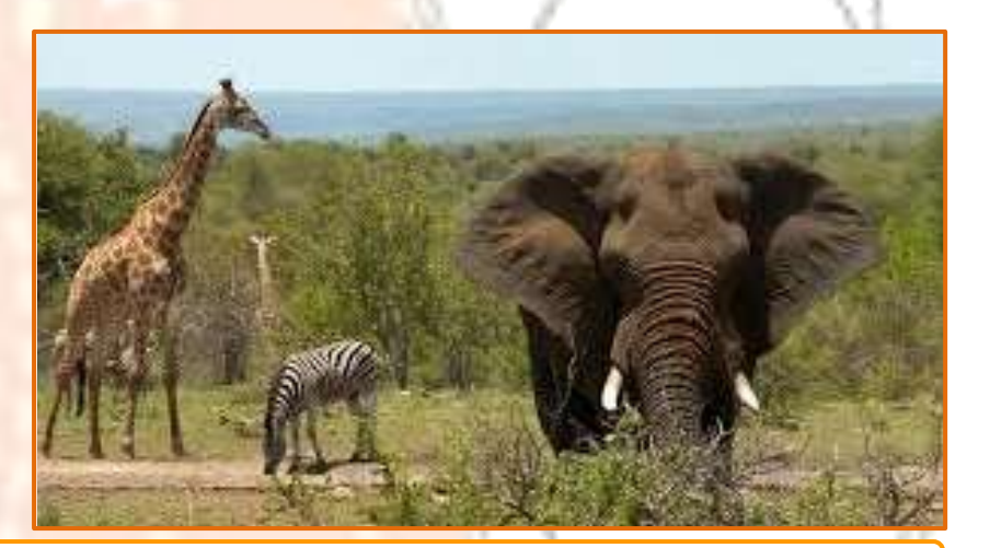
From left hand side are flock of rare Crested Guinea Fowl, Girraffe, Zebra and an Elephant

This reserve is community based reserve and has 4 blocks for hunting which are Irkiushbour, Talamai, Maasai, EAST AND Maasai west-Naibourmurtu.