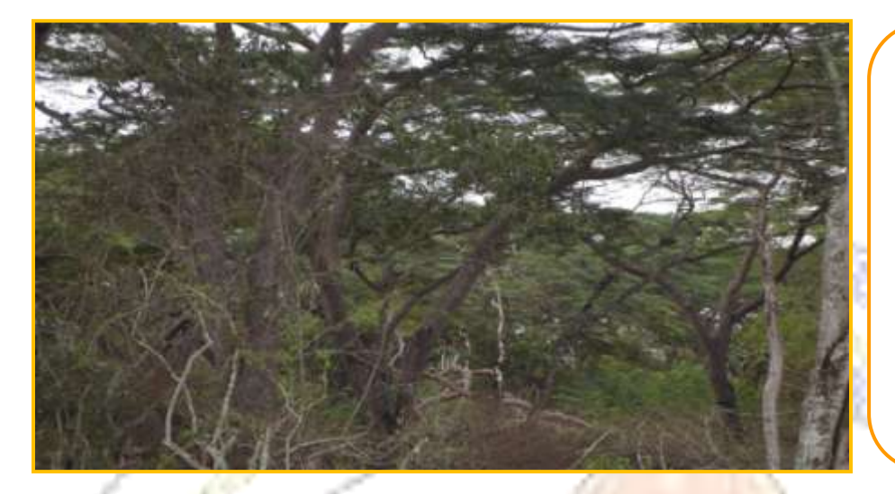
All 3 photographs are for International recognized SULEDO Forest reserve found which is jointly to 3 Wards of Sunya, Lengatei and Dongo.