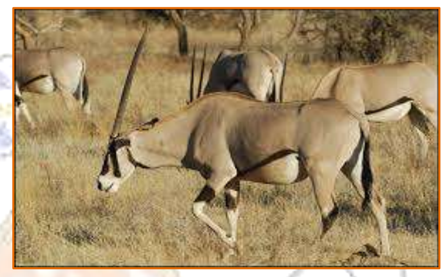
The rare Antilope of Generuk to the left and Oryx to the right