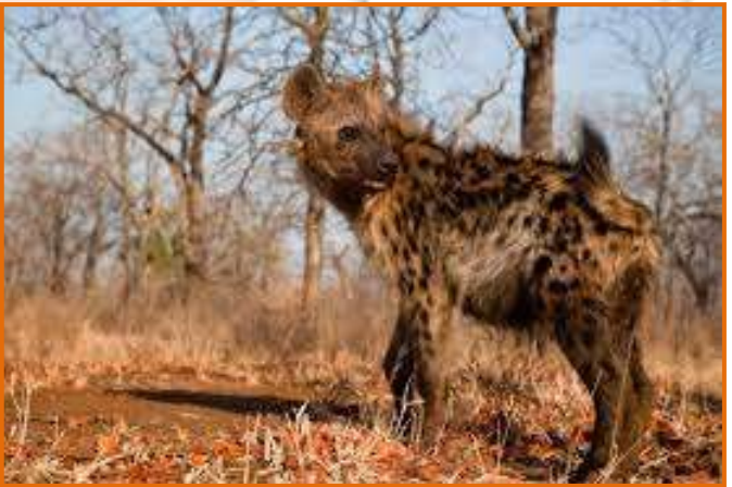
From left is the heard of Buffalo in the bushes feeding and right ward is the Hyene