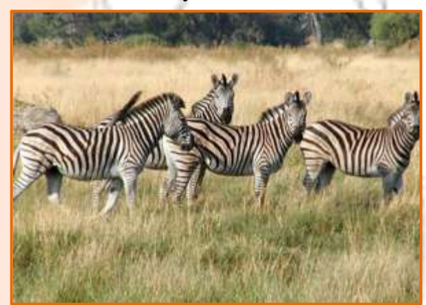
From left hand side are the pride of Lions and Zebras.