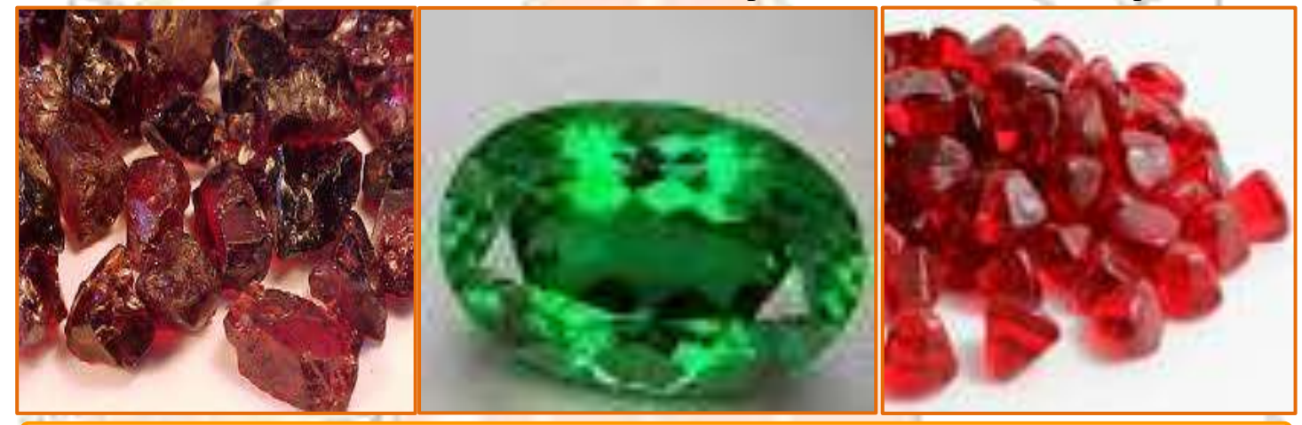
Minerals found in Kiteto Rubi, Redganet, Greentormaline, Rhodelight

Existence of minerals such as Ruby, Redganet, Greentormaline, Rhodelight, White quartz in our District is ideal to determined investors in the well-paid deal of extractions of deposits.